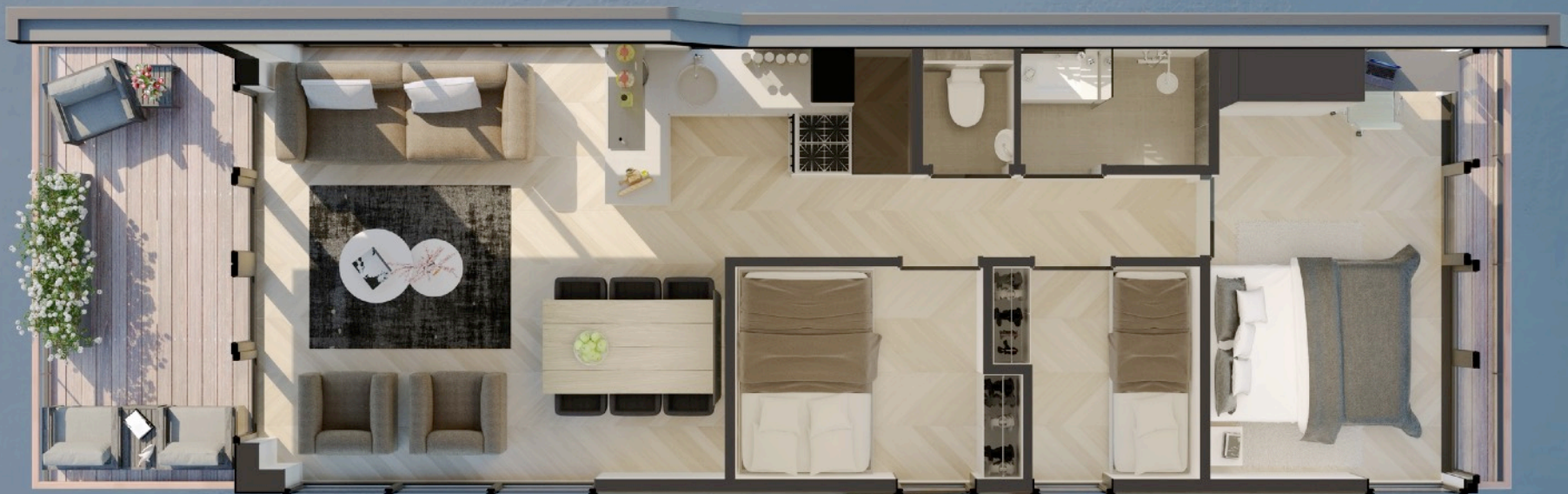
Layout of the Aqua Vive House Boat. The 'Aqua Vive XL Upperdeck' is the same in terms of layout. Both terraces are larger then the standard version.